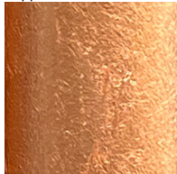
Copper Leaf - CLF