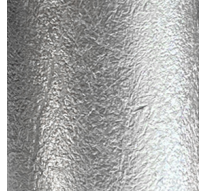
Silver Leaf - SLF